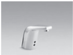
Sculpted single-hole Touchless DC-powered commercial bathroom K-13460-CP